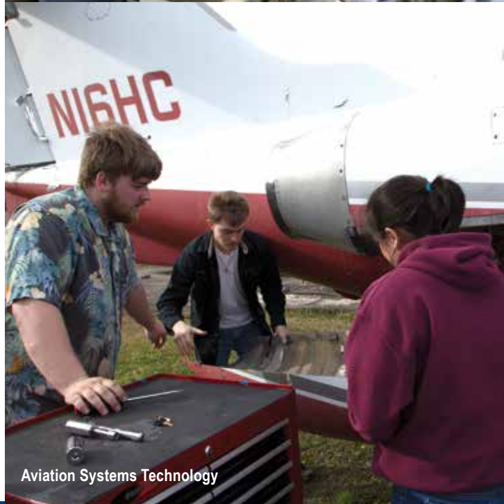
Aviation Systems Technology