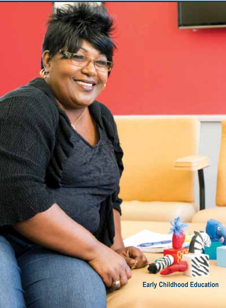
Early Childhood Education