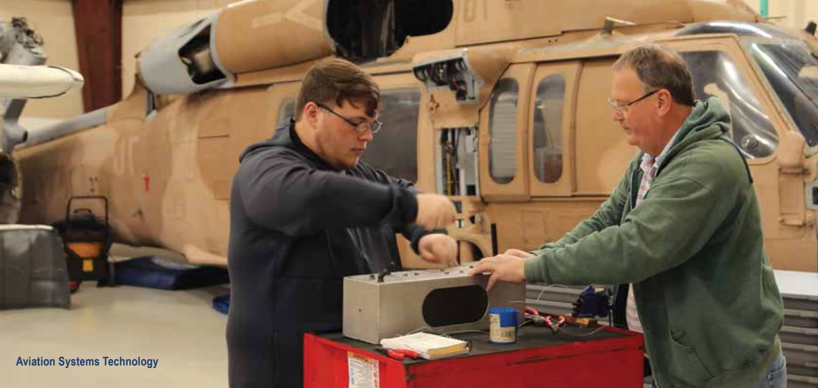
Aviation Systems Technology