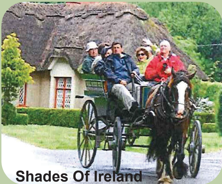
Shades Of Ireland