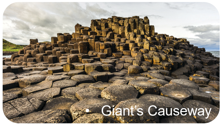
• Giant's Causeway