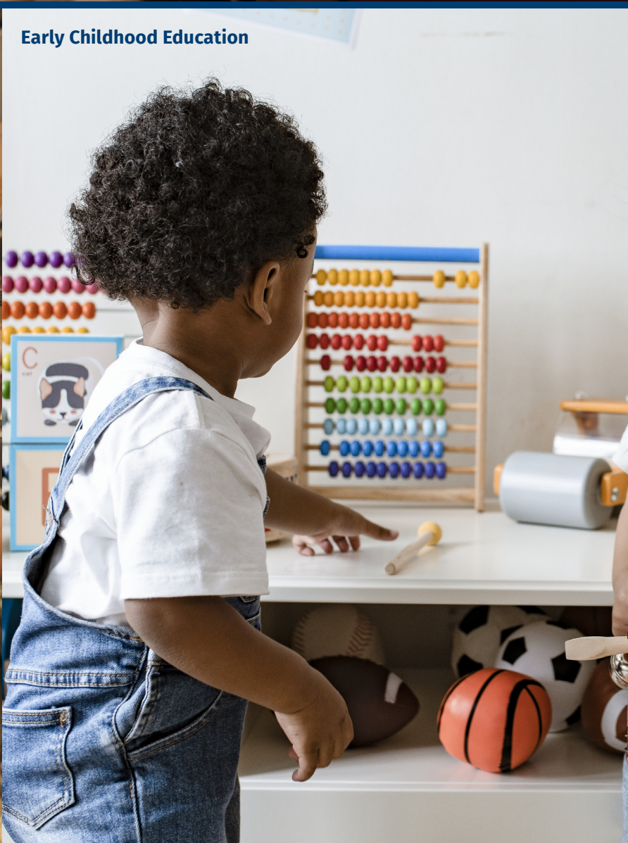
Early Childhood Education