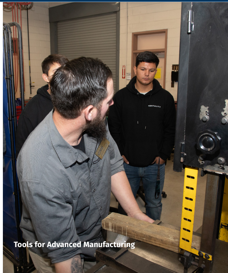
Tools for Advanced Manufacturing

At Craven CC, you can complete your degree in as few as three semesters and transfer to one of North Carolina's public universities or colleges. Our flexible and customized courses provide military and civilian students the skills and confidence they need to succeed. Courses are guided by industry standards and meet the changing needs of the community.