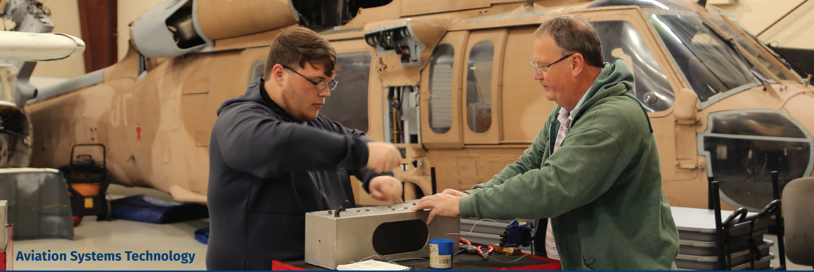
Aviation Systems Technology