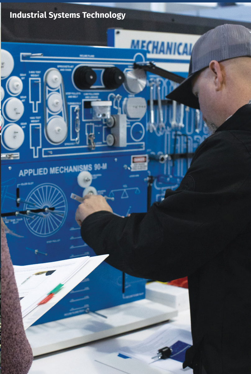
Industrial Systems Technology